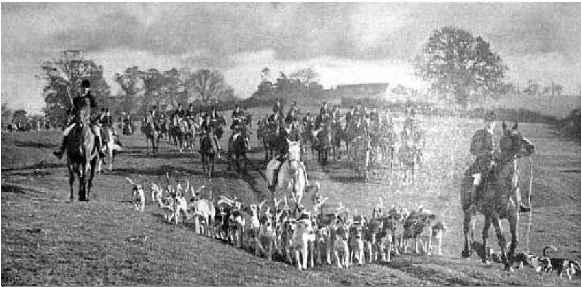
Photo of Whaddon Chase

Although it is a subject people do not wish to talk about these days, Whaddon was a hunting village and the Whaddon Chase Hunt was probably one of the top hunts in the country.