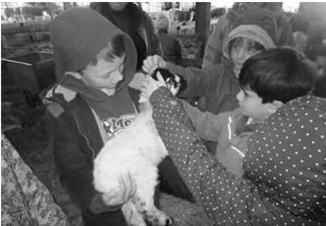
Coddimoor Farm - hands on experience in the lambing shed