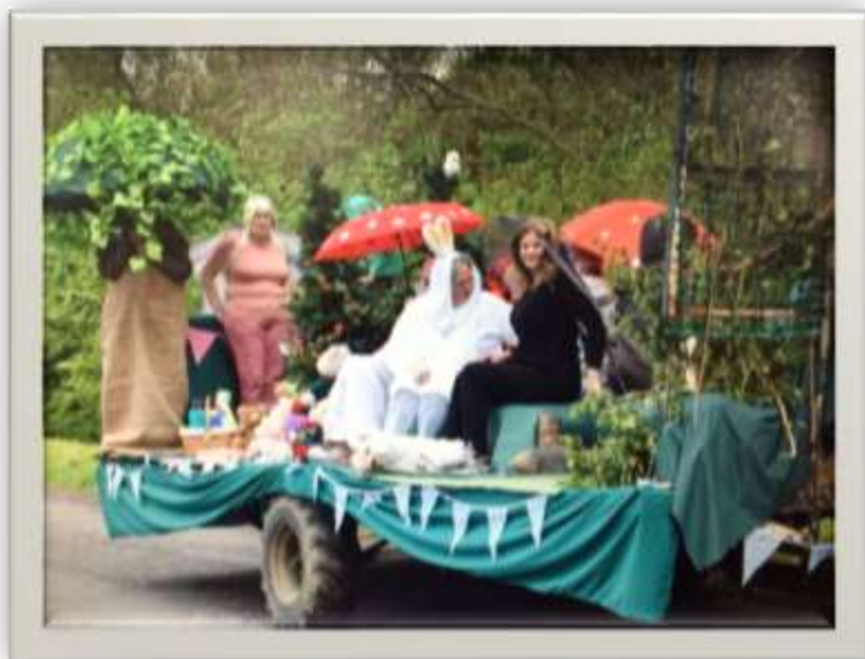
The WI - moving with the times

AS THE joint chairpersons of the Friends of Whaddon School, we would like to take this opportunity to say a huge thank you to all the people who helped at our May Fayre. Thanks in particular go to the Whaddon Women's Institute (WI) and everyone who helped on the floats.