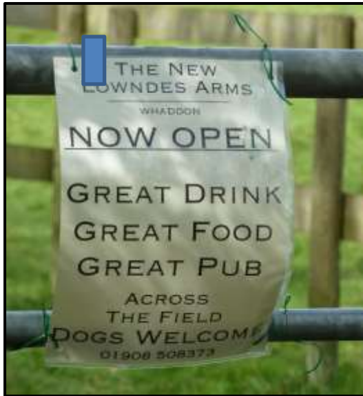
One of several ‘silent salesmen’ dotted around neighbouring public footpaths, pointing the way across fields to a ‘hideaway’ offering something to eat and a welcome drink.

rooms are being renovated and may well all be completed by the time this is published.