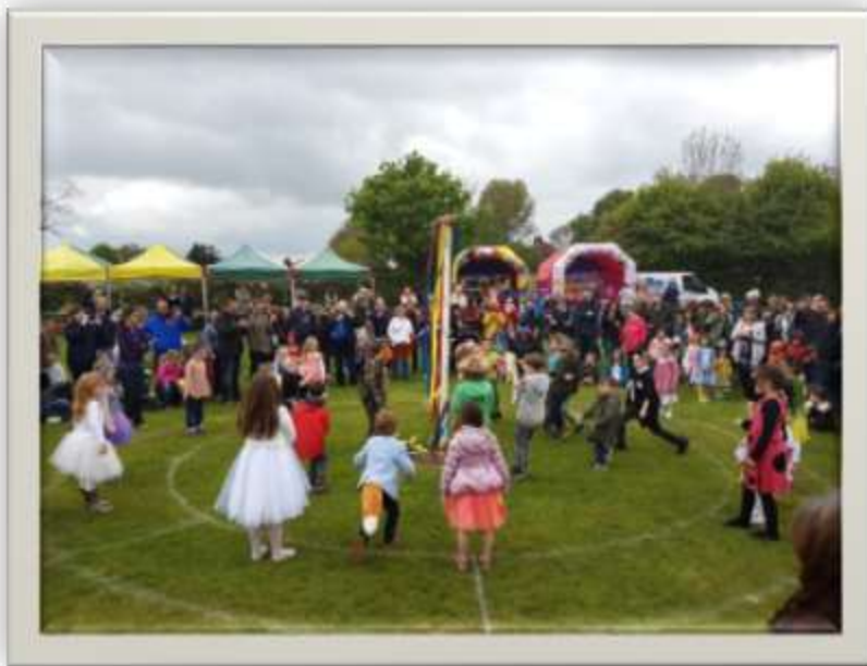
Spirited action seen with maypole dancing

setting up the bar and serving and Linda Beech for helping out with just about everything!