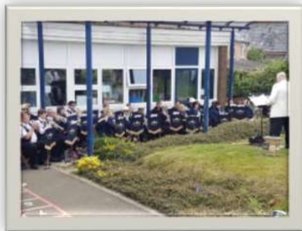
Winslow Concert Band in full swing

AS THE joint chairpersons of the Friends of Whaddon School, we would like to take this opportunity to say a huge thank you to all the people who helped at our May Fayre. Thanks in particular go to the Whaddon Women's Institute (WI) and everyone who helped on the floats.