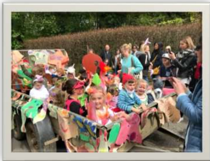
Whaddon School float earns smiles all round